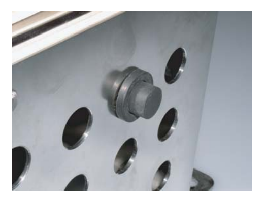
D Hold the plug at the base and remove.